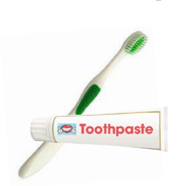
Toothbrush and paste