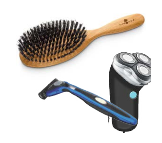
Hair Brush Shaving kit